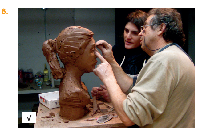
According to the given sign and picture, which one is correct?